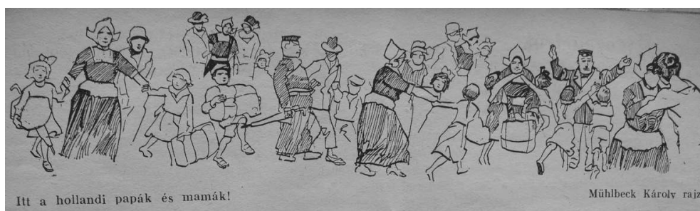
"Here are the Dutch Fathers and Mothers", 1924.130