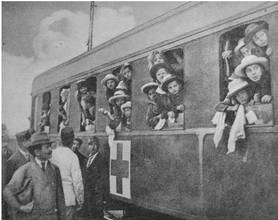
"600 Hungarian Children arrive back from Holland", Budapest, 1921.113