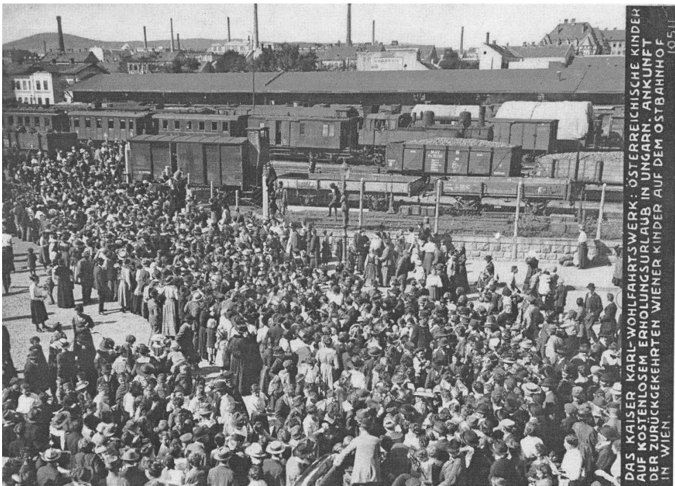
"Austrian Children Departing to Hungary at the train station in Vienna", 1918.71