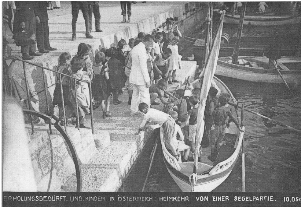
"Hungarian Children coming back from a boat tour", 1918.80