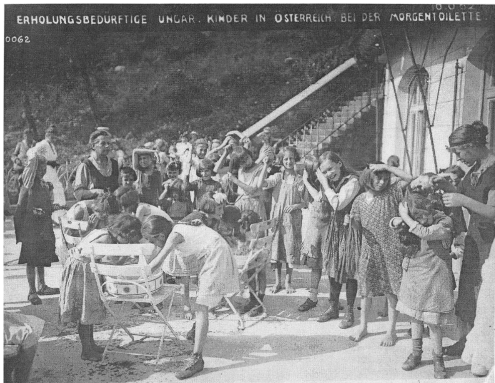
"Hungarian Children on Summer Vacation in Austria. Morning toilet", 1918.79