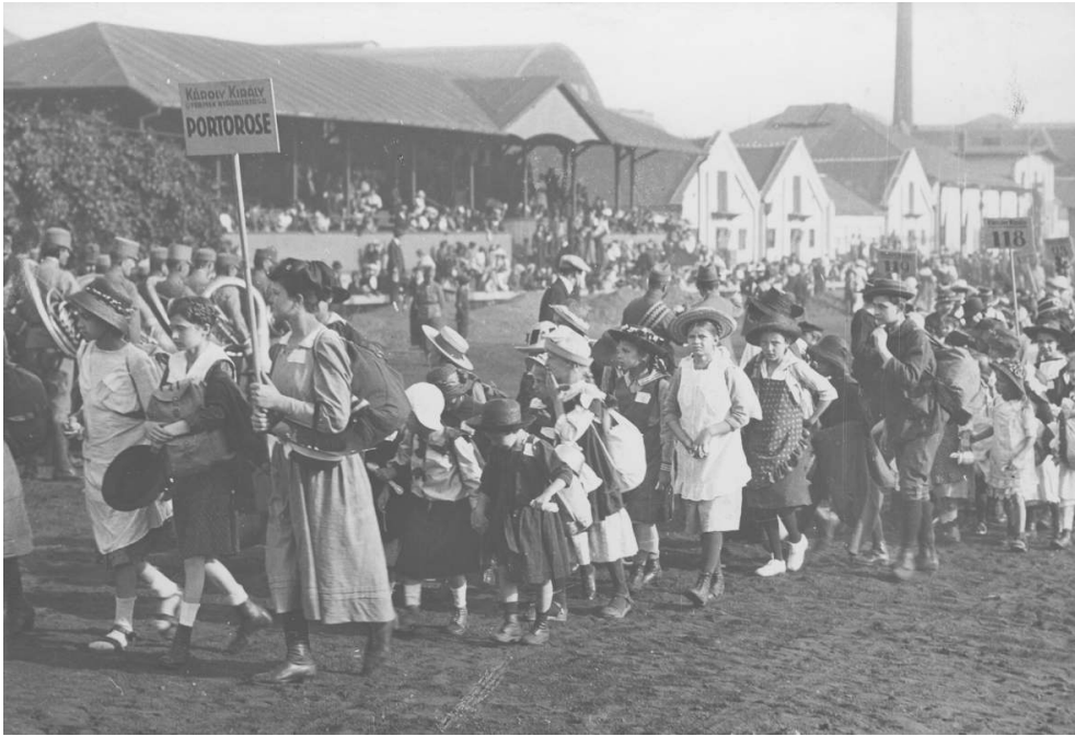
Müllner János, "Departure to Eastern Train Station", Budapest, 1918.68