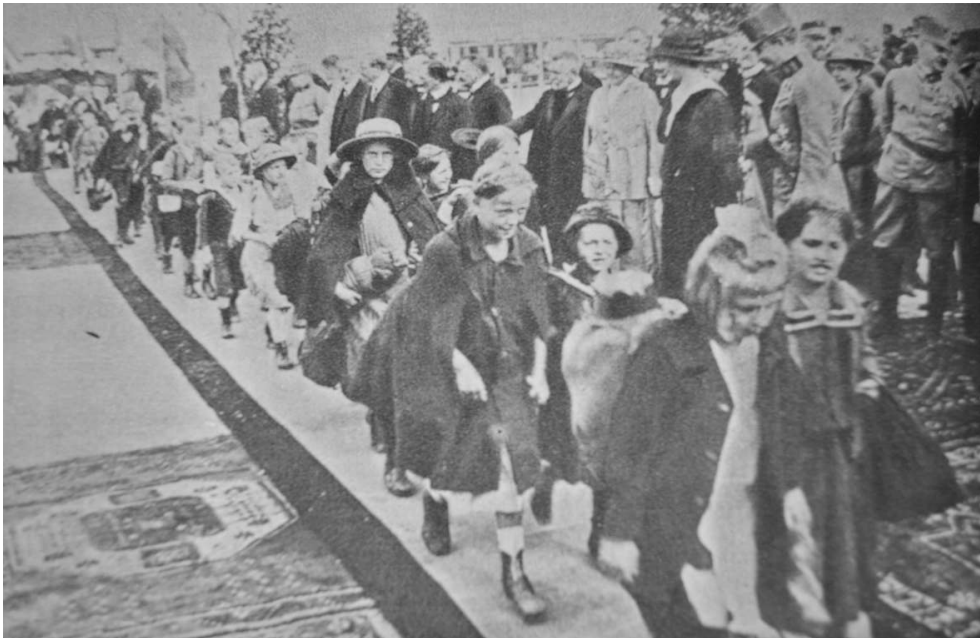
"The Royal Couple among Children", 1918. 85