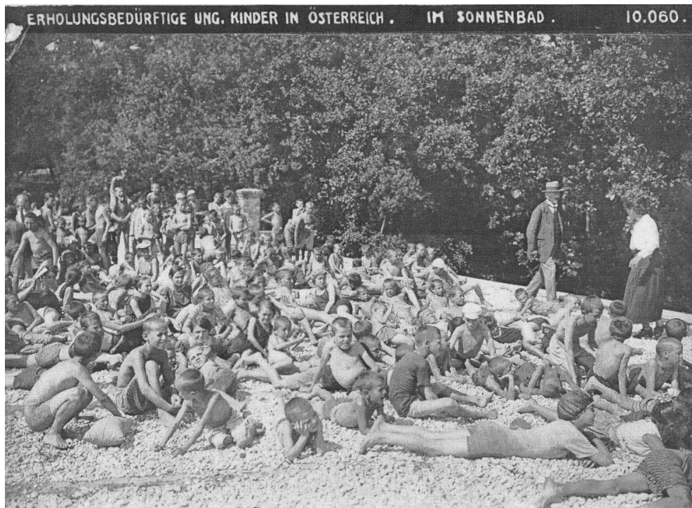
"Needy Hungarian Children in Austria. Sunbathing", 1918.78