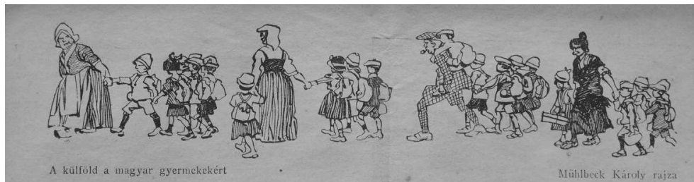
"Foreign countries for Hungarian Children", 1920.115